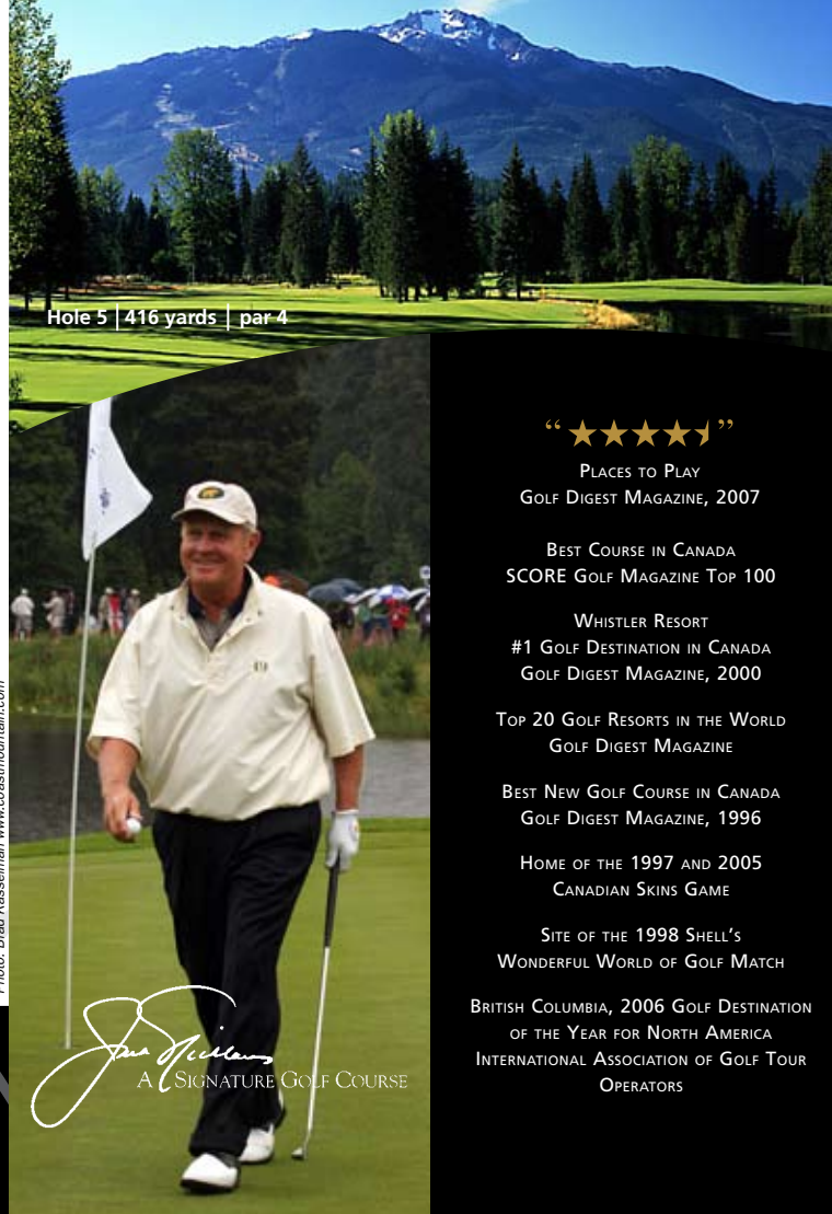
Hole 5 | 416 yards | par 4