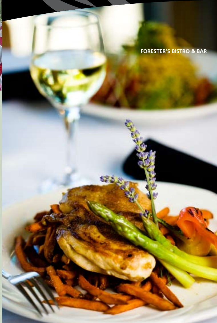
FORESTER'S BISTRO & BAR

"Hole #17 is one of the most tranquil settings you'll ever see on a golf course." Ian Cruickshank, Toronto Star